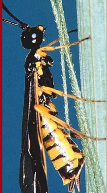
Figure 4. Wheat stem sawfly depositing eggs in a mature wheat stem.