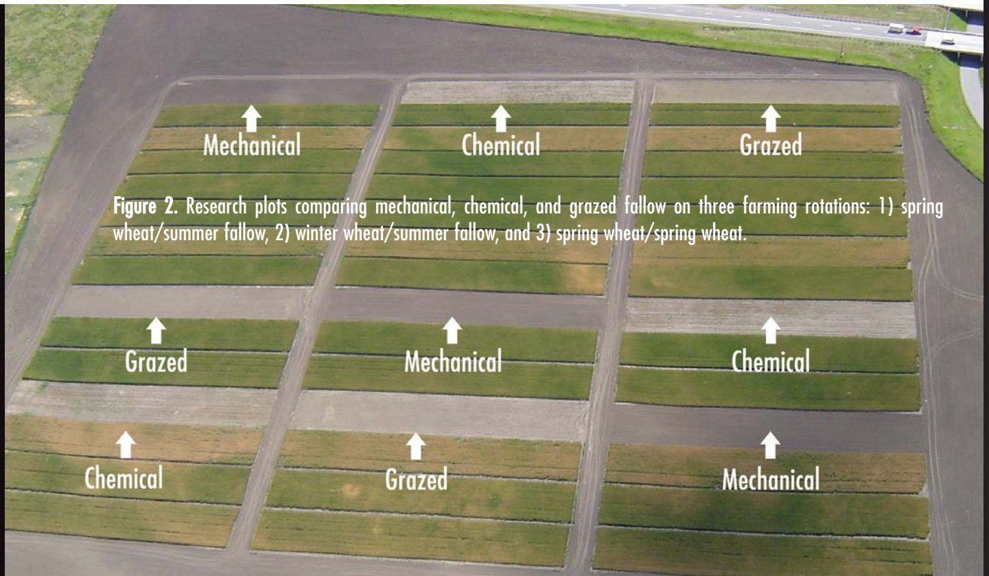
Figure 2. Research plots comparing mechanical, chemical, and grazed fallow on three farming rotations: 1) spring wheat/summer fallow, 2) winter wheat/summer fallow, and 3) spring wheat/spring wheat.

Cereal crop residues are primarily fibrous carbohydrates, unusable as feed for non-ruminants, like pigs and chickens, and lacking the energy density to warrant processing or transport. Small grain residue, particularly in high production settings, is often considered a hindrance to the primary production of grain. Targeted grazing offers managers another way to handle residue in response to market and environmental goals and restrictions. In the future, burning crop residue may be banned, leaving spreading, baling, and grazing as the only options.