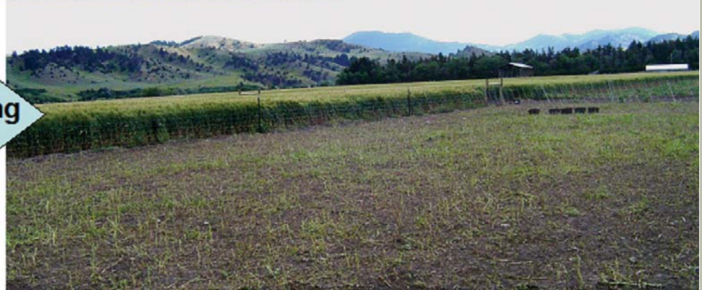
Figure 1. Sheep grazing to control weeds in a fallow field in Montana.

increases the potential for erosion. Incorporating grazing could reduce these tillage impacts and offer an alternative to herbicides while being able to control the amount of residue that remains for ground cover.