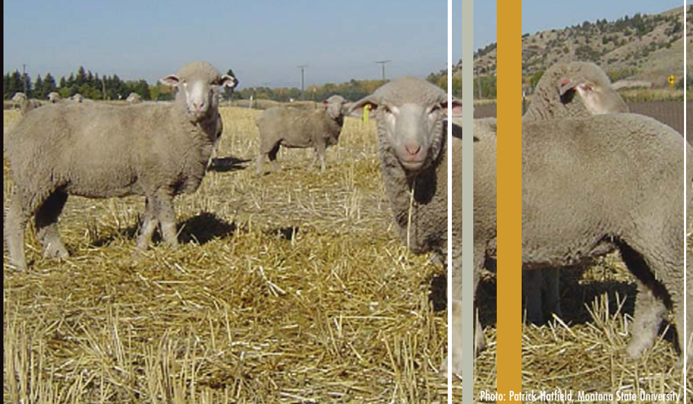
Figure 3. Sheep grazing crop stubble in Montana, reducing excess crop residue and incorporating organic matter into the soil.